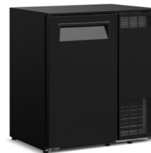
BC1100 Bottles: 144

* 我司有权利更改产品设计和配置, 不会提前告知客户! We have the right to change the product design and configuration without informing customers in advance!