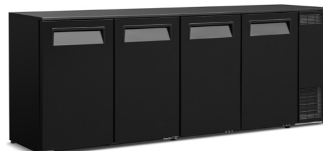
BC4100 Bottles: 675