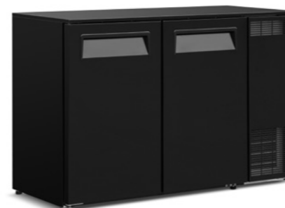
BC2100 Bottles: 315