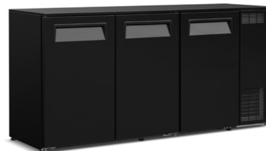
BC3100 Bottles: 495