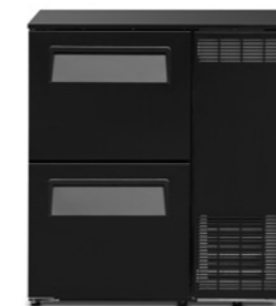
BC1120 Bottles: 80

* 我司有权利更改产品设计和配置, 不会提前告知客户! We have the right to change the product design and configuration without informing customers in advance!