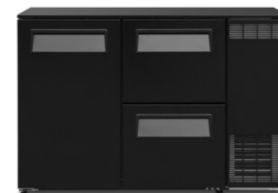
BC2120 Bottles: 224