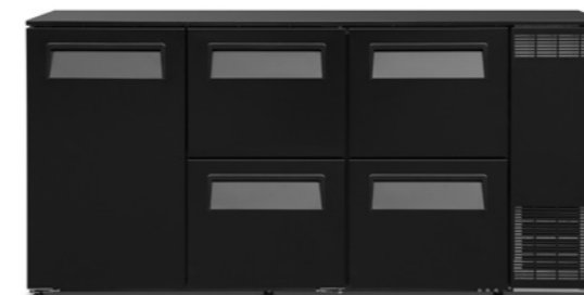
BC3140 Bottles: 304