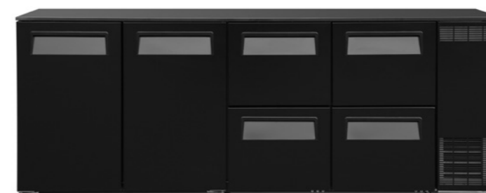
BC4140 Bottles: 484